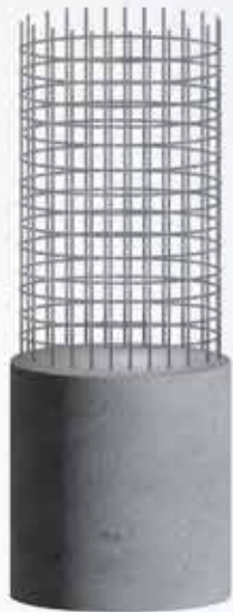
Low density of Fe 550D Indigo TMT rebars