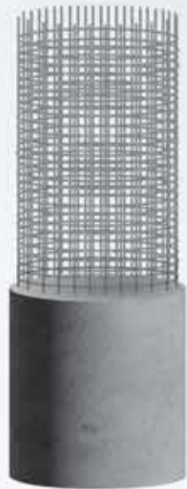
High density of other Fe 550 TMT rebars